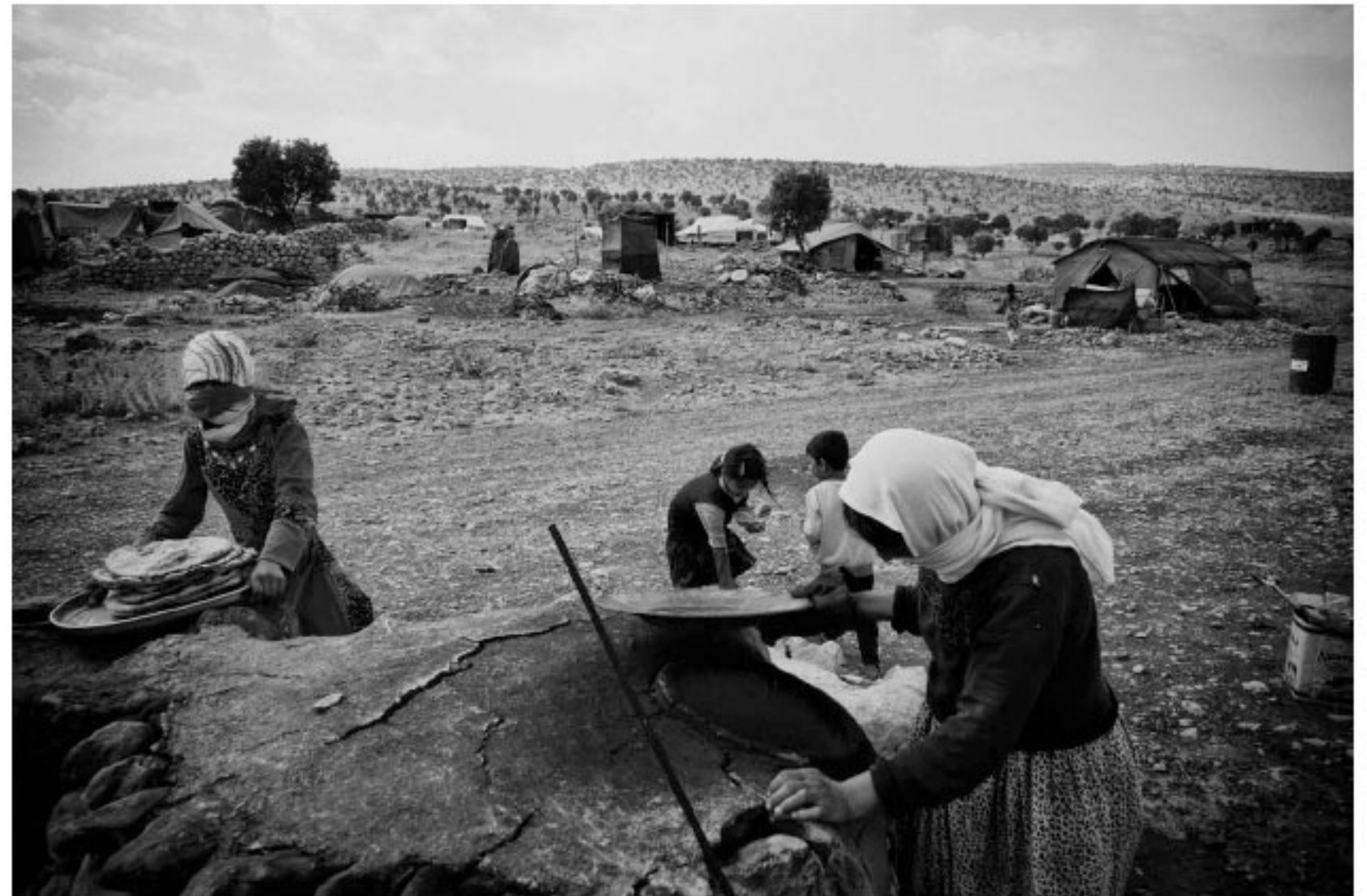
Iraq - September 2014 - Yazidi families that fled the city of Sinjar to the mountains after the Islamic State seized the city on August 3rd prepare bread in a makeshift camp. During the following days, IS militants perpetrated the Sinjar massacre, killing 2,000 Yazidi men and taking Yazidi women into slavery, leading to a mass exodus of some 50,000 Yazidi residents who fled to Mount Sinjar. According to a UN report, 5,000 Yazidi civilians were killed during the Islamic State August offensive.