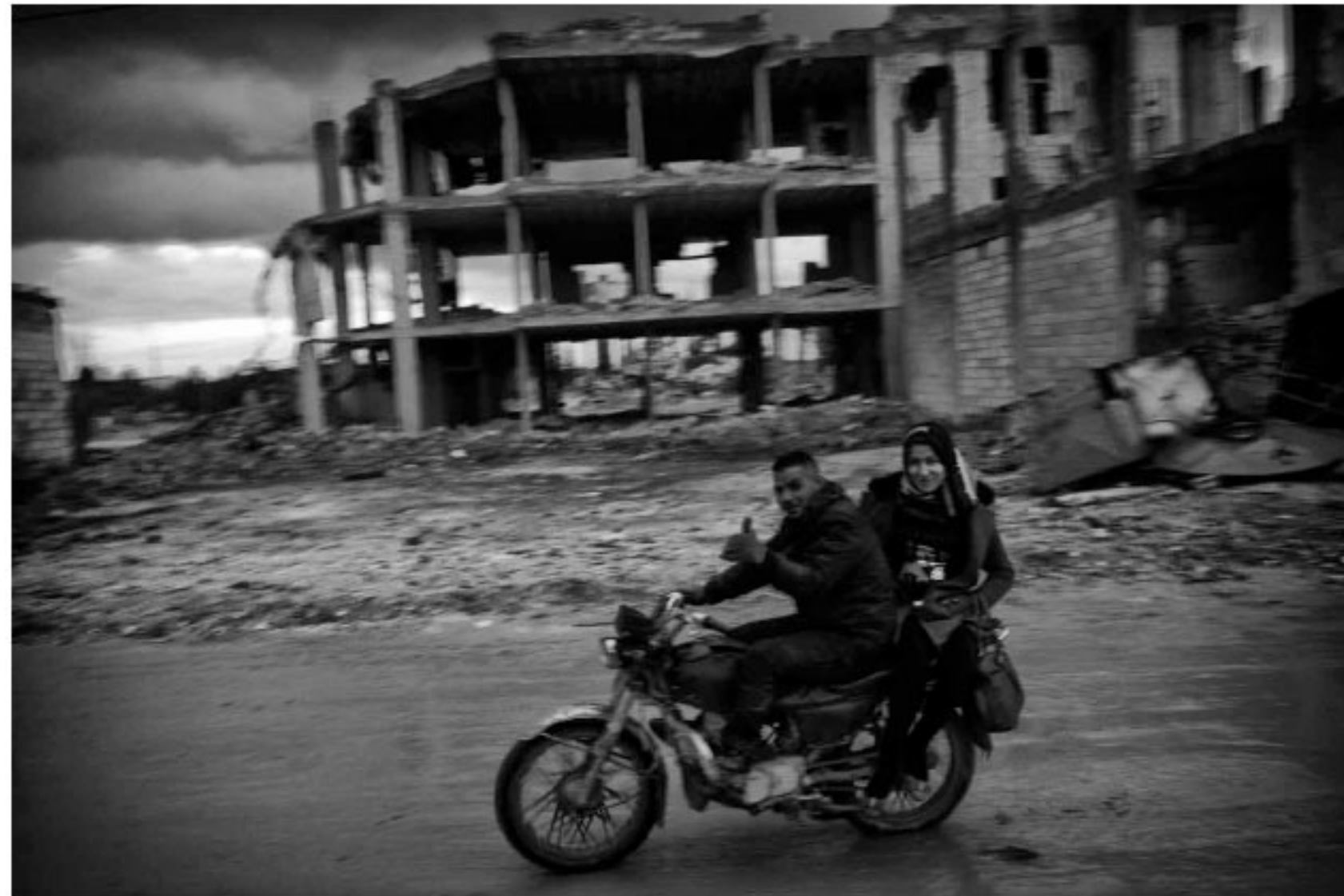
Syria - Jan 2016 - A local couple ride a motorcycle through the rubble that was once Kobane, now completely destroyed by months of Islamic State siege, very few residents remain as most have fled across the border to Turkey.