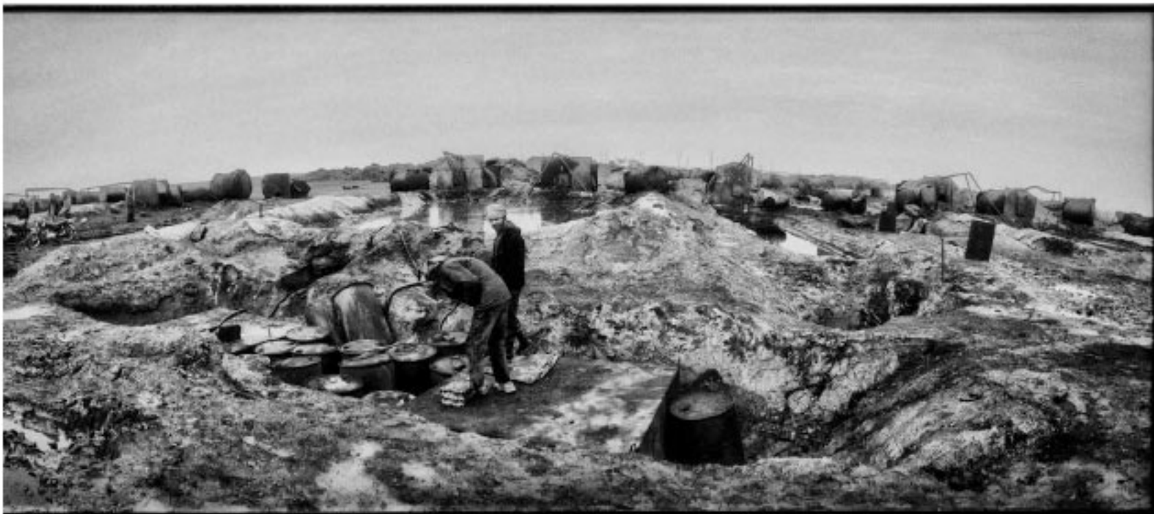
Syria - Jan 2016 - In the small town of Al-Yarubiyah on the Syrian-Iraqi border, locals Syrians attempt to make fuel out of crude oil as most of the refineries are out of order causing a huge shortage of fuel.