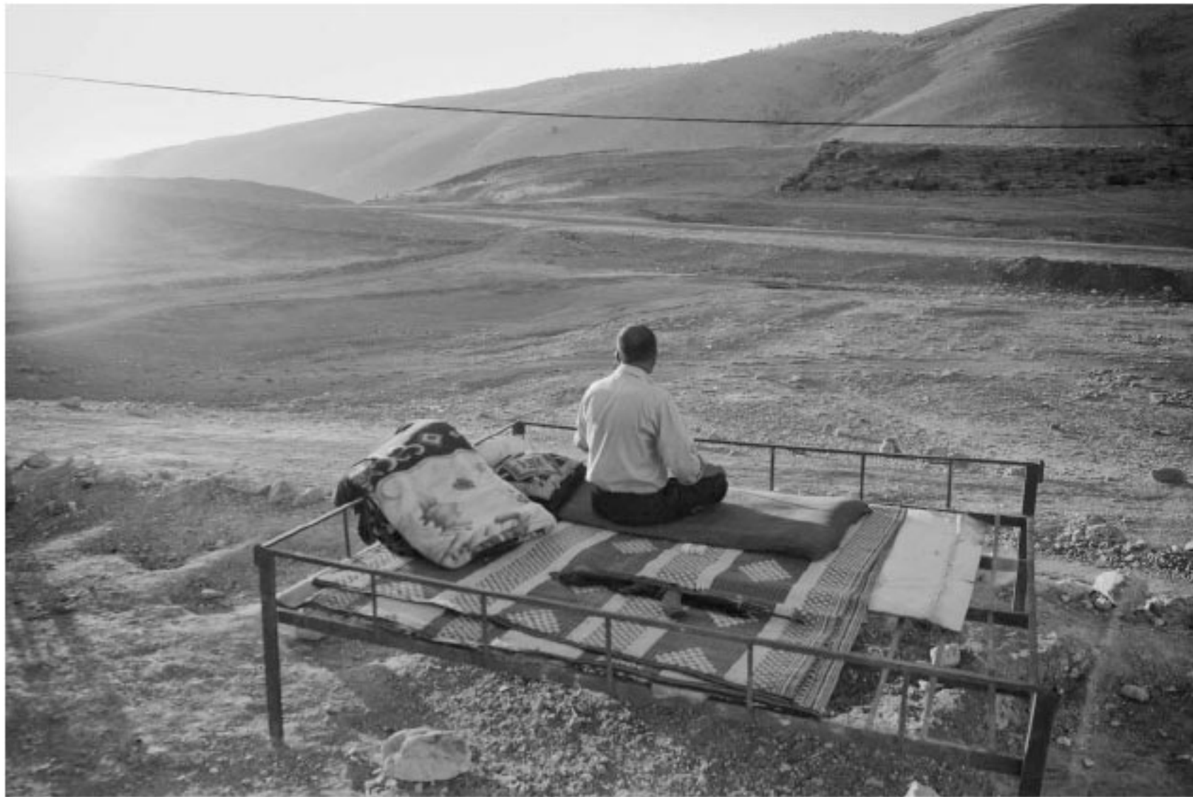
Iraq - September 2014 - Sunrise in Sharaf al Deen on Mount Sinjar. A local Yazidi man awakes, his weapon close by, he is part of a volunteer Yazidi Army made up of some 2000 members of all ages and little weapons. They do what they can to protect their holy places and to repel daily attacks by the Islamic State.